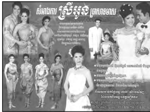
An ad for a store selling and renting wedding costumes

Here's the test that verifies that the clause is dependent: remove it completely, and see if the sentence still makes sense. Try it. Read the entire sentence (which is actually the entire paragraph), omitting the dependent clause. It still makes sense, right? The clause provides us some additional information about the investigation, but it's not essential to the sentence making sense. The clause is marked off from the rest of the sentence with the relative pronoun marker ដែល , which very often introduces such clauses. Ask your instructor if any of this isn't clear to you. Note that it's good practice in written Khmer to separate out your dependent clauses when you're writing by putting a space before and after the clause. The writer of this article—and the editor of the newspaper—did not do that. But you should, when you write in Khmer!