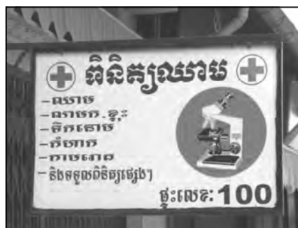
Blood testing in សៀមរាប

Our next dependent clause occurs in paragraph two. Actually, there are two dependent clauses in that paragraph. The first (and it is preceded by a space, but not followed by one) is អ្នកដោយធនាវិជ្ជាក . The second dependent clause